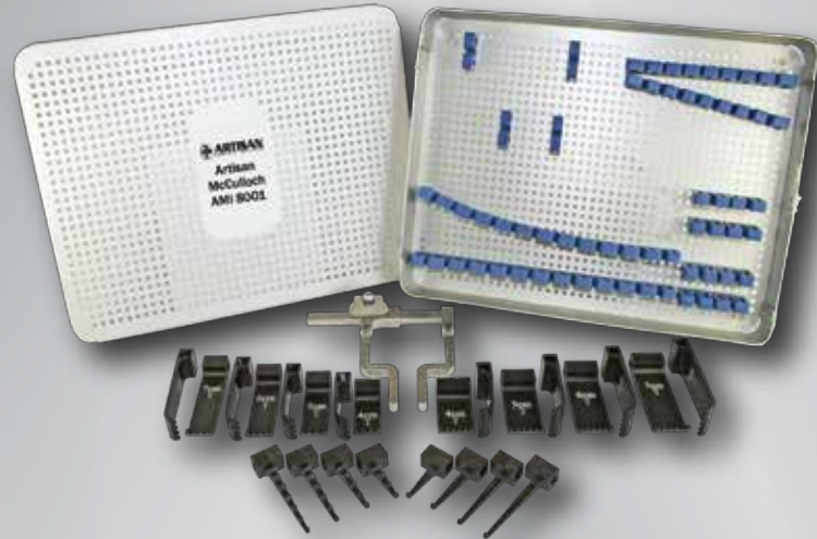
McCulloch Retractor Set AMI-8001