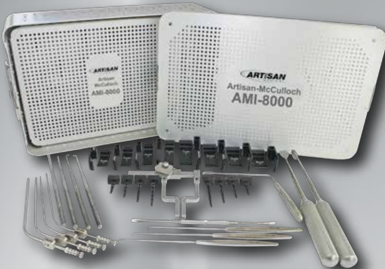
McCulloch Microdissection Set AMI-8000