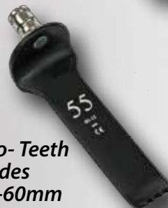
SL Micro-Teeth Blades 35mm-60mm