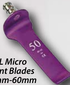
SL Micro Blunt Blades 35mm-60mm