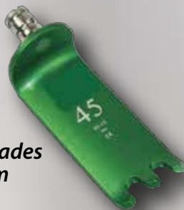
SL Long Teeth Blades 30mm-65mm