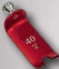
SL Short Teeth Blades 30mm-65mm