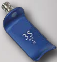
SL Blunt Blades 30mm-75mm