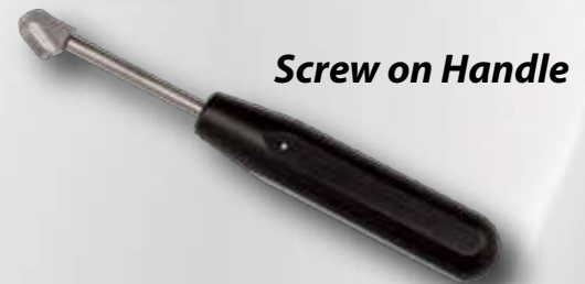
Screw on Handle