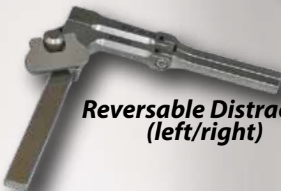
Reversible Distractor (left/right)